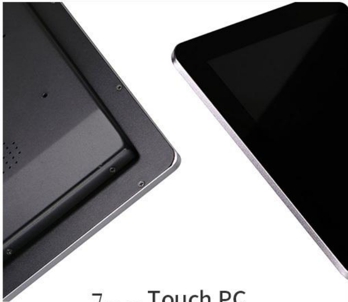
7mm Touch PC Frame Design