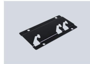
Wall mount bracket