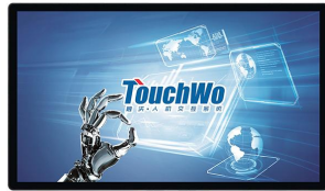
Wall mount bracket