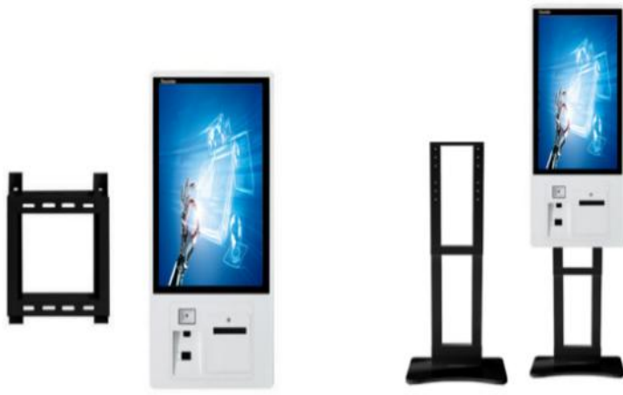
Wall mount bracket